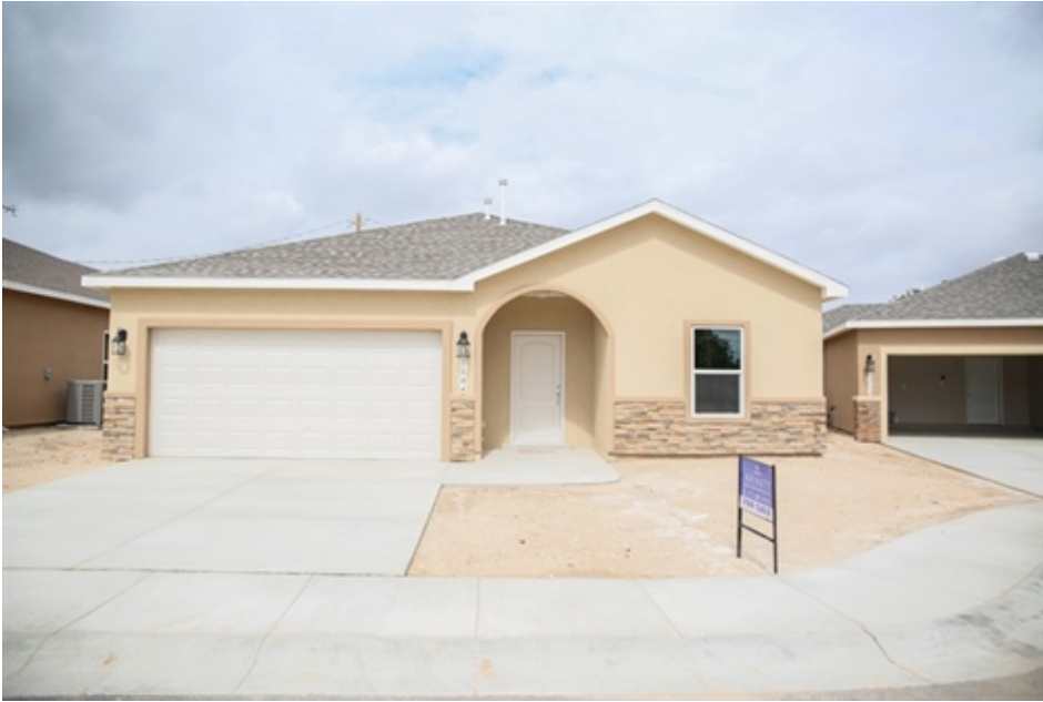
The Kaitlin, Carlsbad, NM 88220